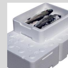
EPS 6 fish boxes