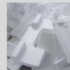
EPS packages or EPS production waste